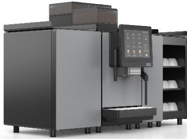
Caption 1: The New A Line's modular design combines clear form language and balanced proportions, creating a cohesive and performance-driven system for professional coffee environments.