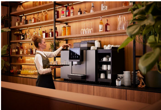
Caption 2: Premium materials and refined surfaces allow Franke Coffee Systems' New A Line to integrate seamlessly into different hospitality environments.