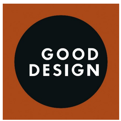
Caption 3: Franke Mytico was honored with the 2023 GOOD DESIGN® Award.