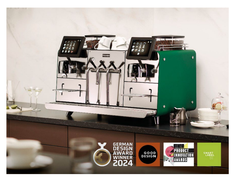
Caption 1: Franke Mytico is an eye-catching addition to any setting.