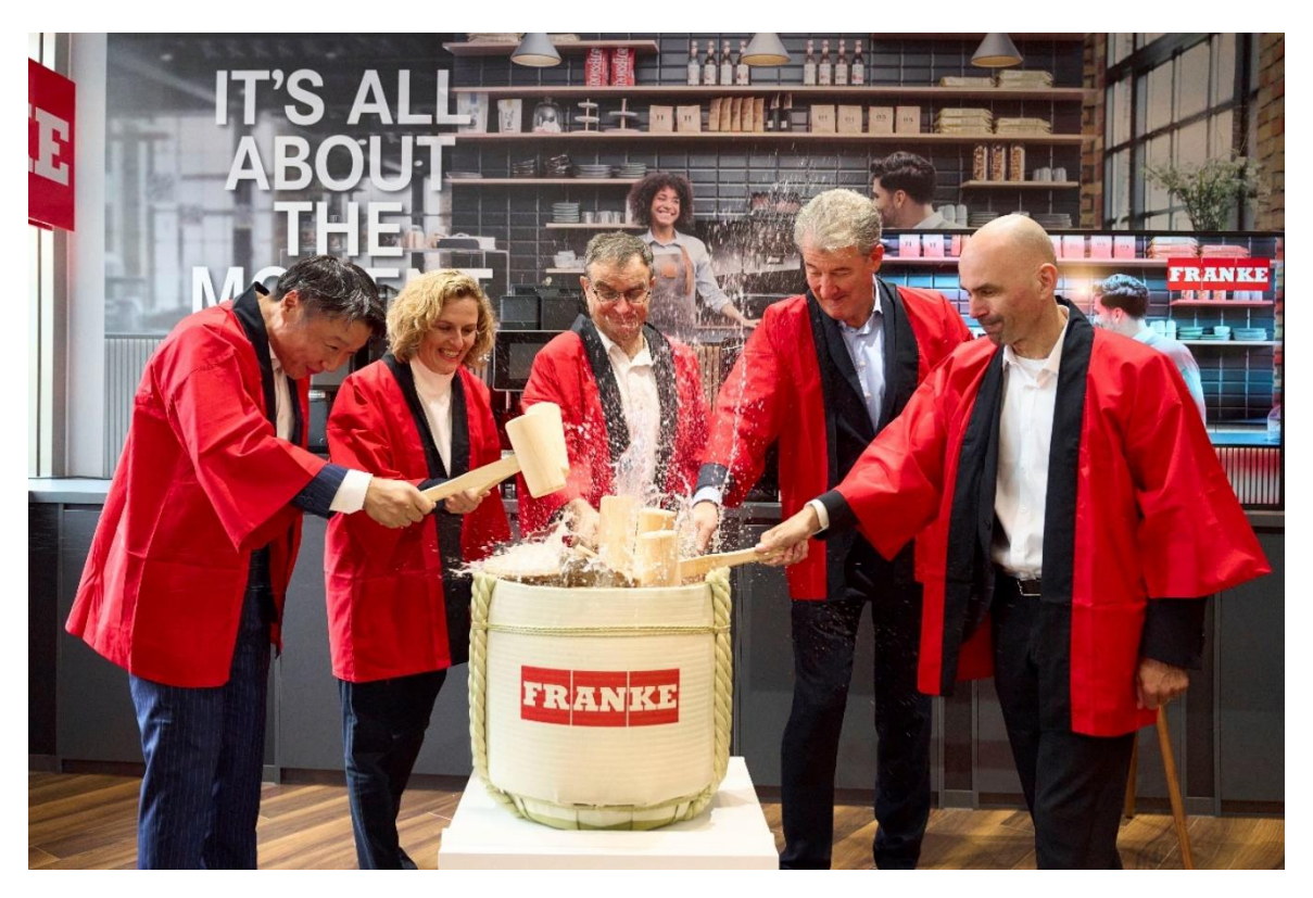
The Sake Barrel Ceremony