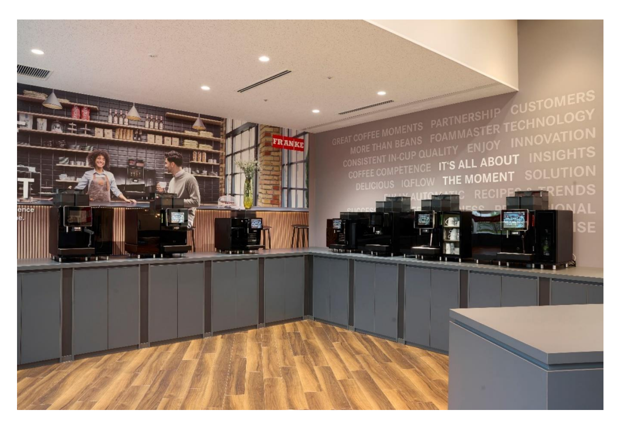
Franke Coffee Systems Japan Showroom