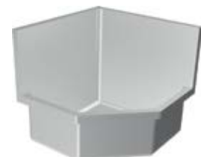
FSS2210/316-1 Install Left or Right