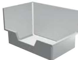
FSSOL223410/316-1 Install Left and Rear