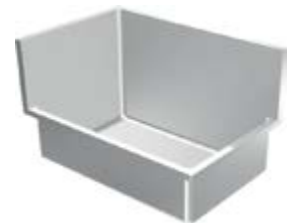
FSSL223410/316-1 Install Left and Rear