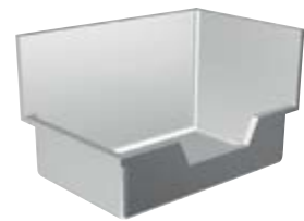
FSSOR223410/316-1 Install Right and Rear