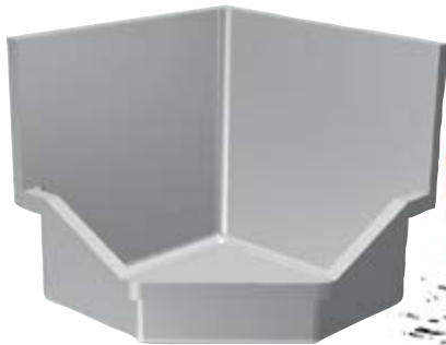
FSS02210/316-1 Install Left or Right