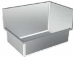
FSSR223410/316-1 Install Right and Rear

24 x 24" Overall (square) or 24 x 36" Overall (rectangular)