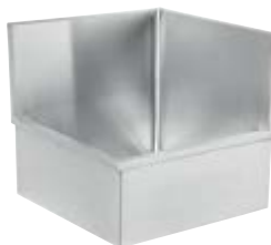
FSS22210/316-1 Install Left or Right