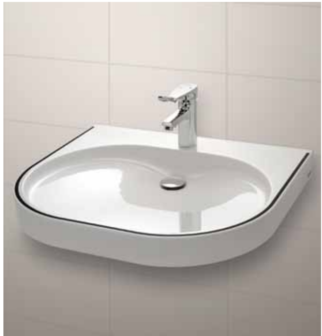
VARIUScare with colour stripe in the basin edge