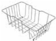
STAINLESS STEEL DRAINER BASKET