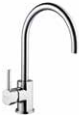
LULA CUT CT 900C RRP : RM 700