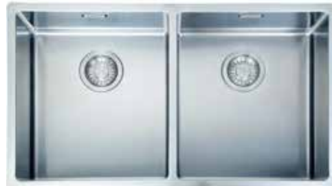
BOX Box 220-36 RRP : RM 2388 Now : RM 1918