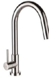
COLD TAP CT 905C- CWO RRP : RM 300