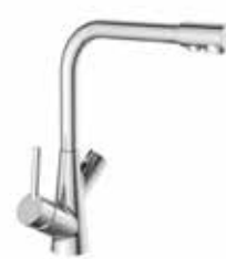
ATHOS CFT 901C RRP : RM 1388