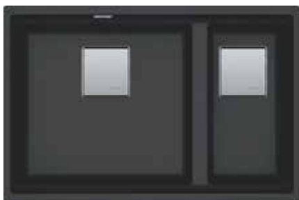
KUBUS 2 KNG 120 RRP : RM 3200

Available In : Dark Brown, Onyx and Stone Grey