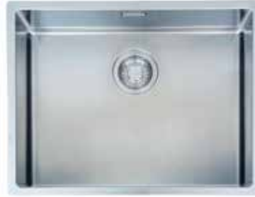
BOX Box 210-54 RRP : RM 1498 Now : RM 1198