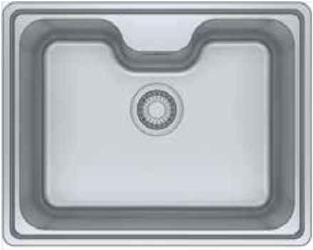
BELL MICRO DECOR BCT 6 10-61 RRP : RM 1080

Micro Decor, A Technology from Nature. Its high-density bee-hive texture limits the direct fingerprint interaction with the sink's surface, thus reducing the transfer of oily and greasy substances.