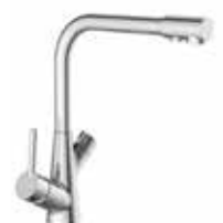
ATHOS CFT 901C RRP : RM 1388