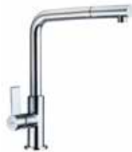
BELL CT 931C RRP : RM 998