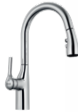
ETHOS CT 993C RRP : RM 1328