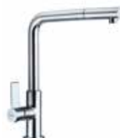
BELL CT 931C RRP : RM 998