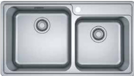
BELL MICRO DECOR BCT 120-42-35 RRP : RM 1200