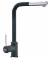
SIRIUS PT932G RRP : RM 1900