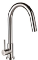
COLD TAP CT 905C- CWO RRP : RM 300