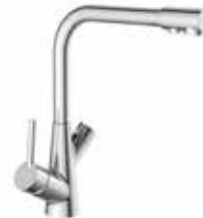
ATHOS CFT 901C RRP : RM 1388