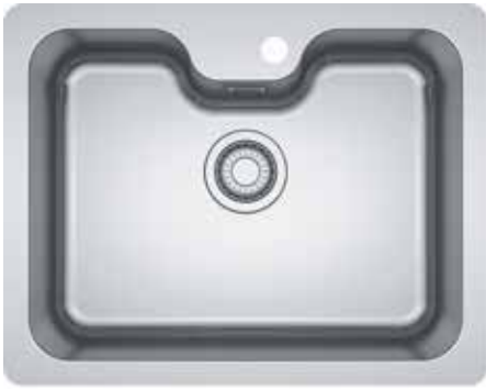
BELL BCX 110-55TL RRP : RM 900

UNDERMOUNT an original, refined installation choice that allows bowls and sinks to be installed underneath marble or synthetic worktops, creating a surface with immaculate lines which is highly functional, elegant and easy to maintain.