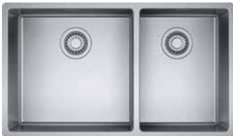
BOX Box 220-74 RRP : RM 2408 Now : RM 1928

A sink that feels tailor-made. With Franke sinks, each detail is considered, right down to a patented integral ledge that helps make prepping and cleaning effortless. With its optimal 200-mm depth bowl, your casual living is made easy.