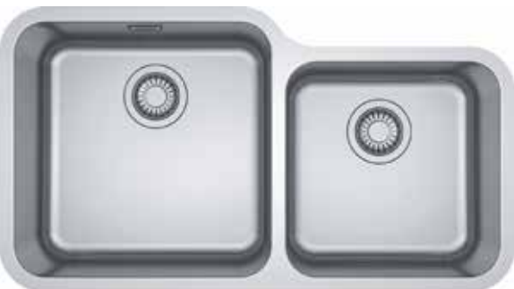
BELL BCX 120-42-35 RRP : RM 1150