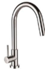
COLD TAP CT 905C- CWO RRP : RM 300