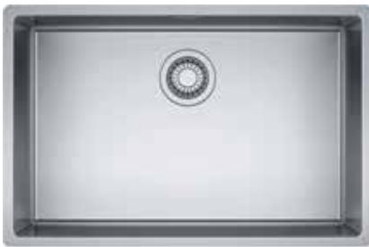
BOX Box 210-72 RRP : RM 1698 Now : RM 1358