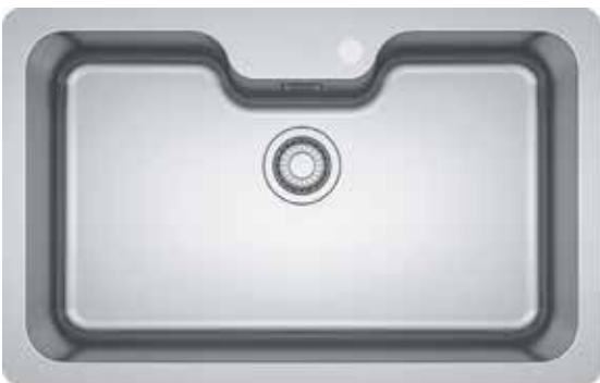
BELL BCX 110-75TL RRP : RM 1050