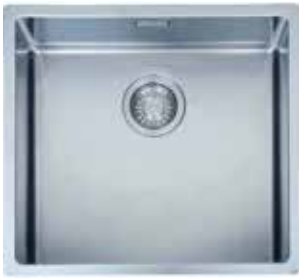
BOX Box 210-45 RRP : RM 1388 Now : RM 1118