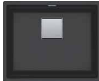
KUBUS 2 KNG 110 52 RRP : RM 2900