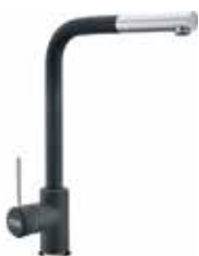
SIRIUS PT932G Colour Mixer