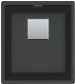
KUBUS 2 KNG 110 37 RRP : RM 2800

Fragranite is an exceptionally tough material which is highly resistant to burns, dents, chips, and stains. It was pioneered by Franke and contains 80% granite to form a unique material with a subtle sheen that is warm to touch.