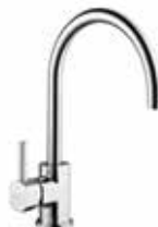
LULA CUT CT 900C RRP : RM 700