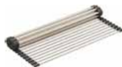
ROLLMAT 112.0256.867 Multi-purpose Accessory