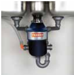
Spazi F/3 connected to Waste Disposer, fitted to triple bowl sink