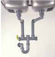
Spazi F/2: Double Bowl Product Code: 301251