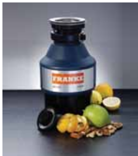
Waste Disposer 0.75Hp with Air Switch Product Code: 82 1079

Electrical Certification: SABS IEC 60 335-2-16