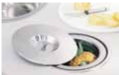
Stainless Steel Lid and 12 Litre Synthetic Bin Product Code: 303204