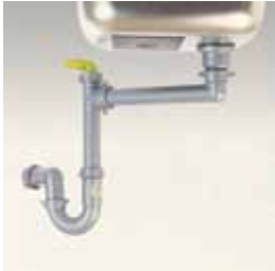
Spazi F/1: Single Bowl Product Code: 301151