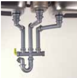
Spazi F/3: Triple Bowl Product Code: 301351