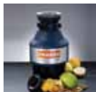
Waste Disposer 0.75Hp Product Code: 821079